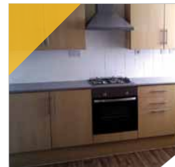
A revived Basildon home ready for tenants to move in

A Basildon family at risk of being homeless has received the keys to their new home thanks to Genesis and the Thames Gateway South Essex Empty Homes Initiative who have partnered with Genesis on the project. The new residents will benefit from a