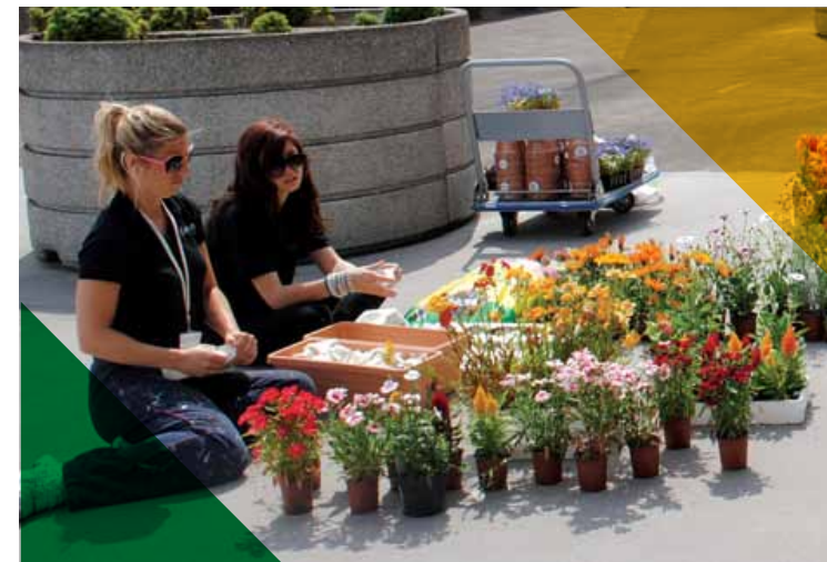
Staff from Genesis Community give the Hamara Ghar roof space a green make over

Genesis staff donned overalls and took to the roof of a housing scheme for Asian elders, transforming it into a relaxing green space for the residents to enjoy. The team cleared the roof space and potted and arranged a collection of new plants to brighten up the area.