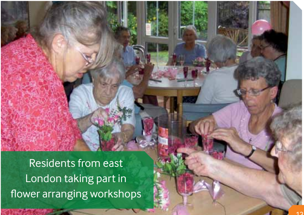
Residents from east London taking part in flower arranging workshops